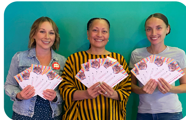
Las Vegas, Nevada