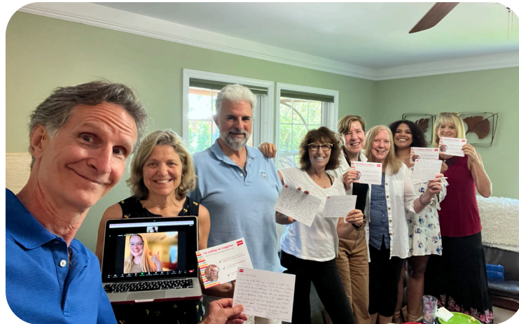
Asheville, North Carolina

We're providing new and experienced advocates a way to raise their voices during the election season — and a path forward after the election. No matter the outcome, we will demand that Congress put poverty on its agenda.