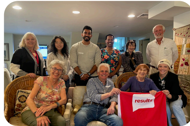
Princeton, New Jersey