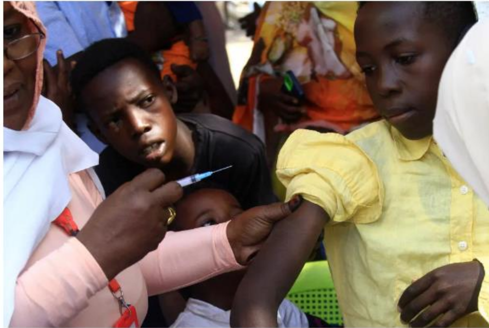
A young woman receiving a vaccine in Sudan last year.