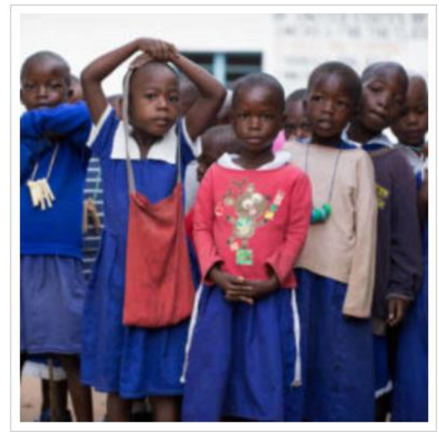
Project Zawadi (Tanzania)