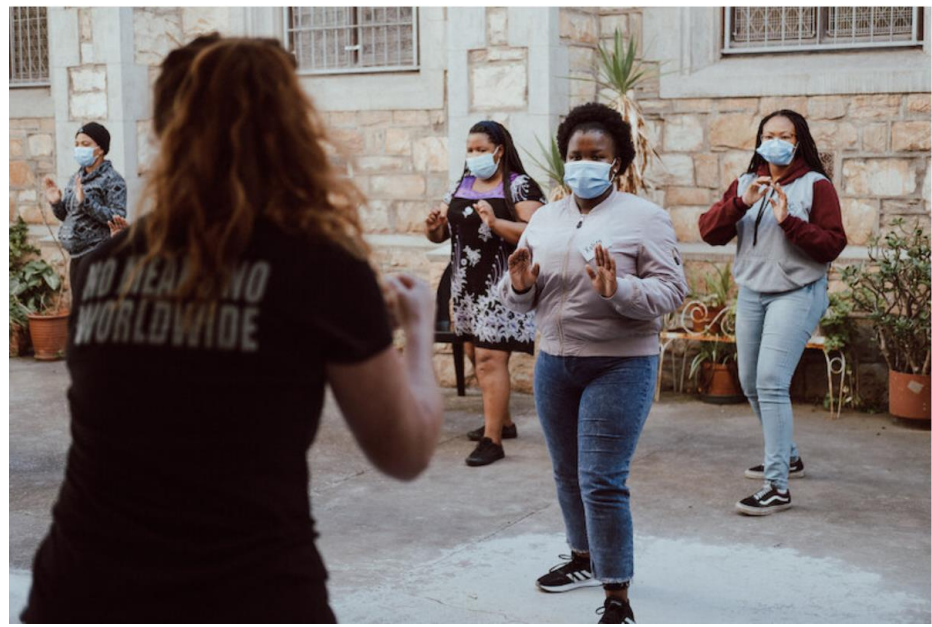
No Means No (South Africa)