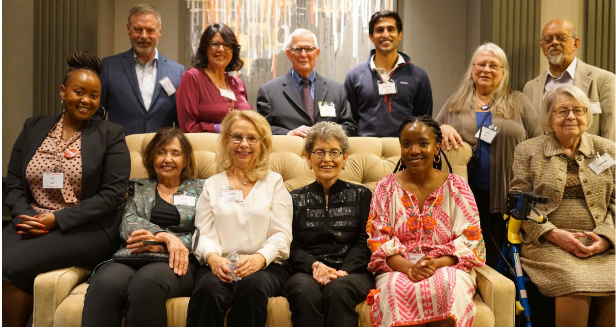
Dallas RESULTS group members and fundraisers