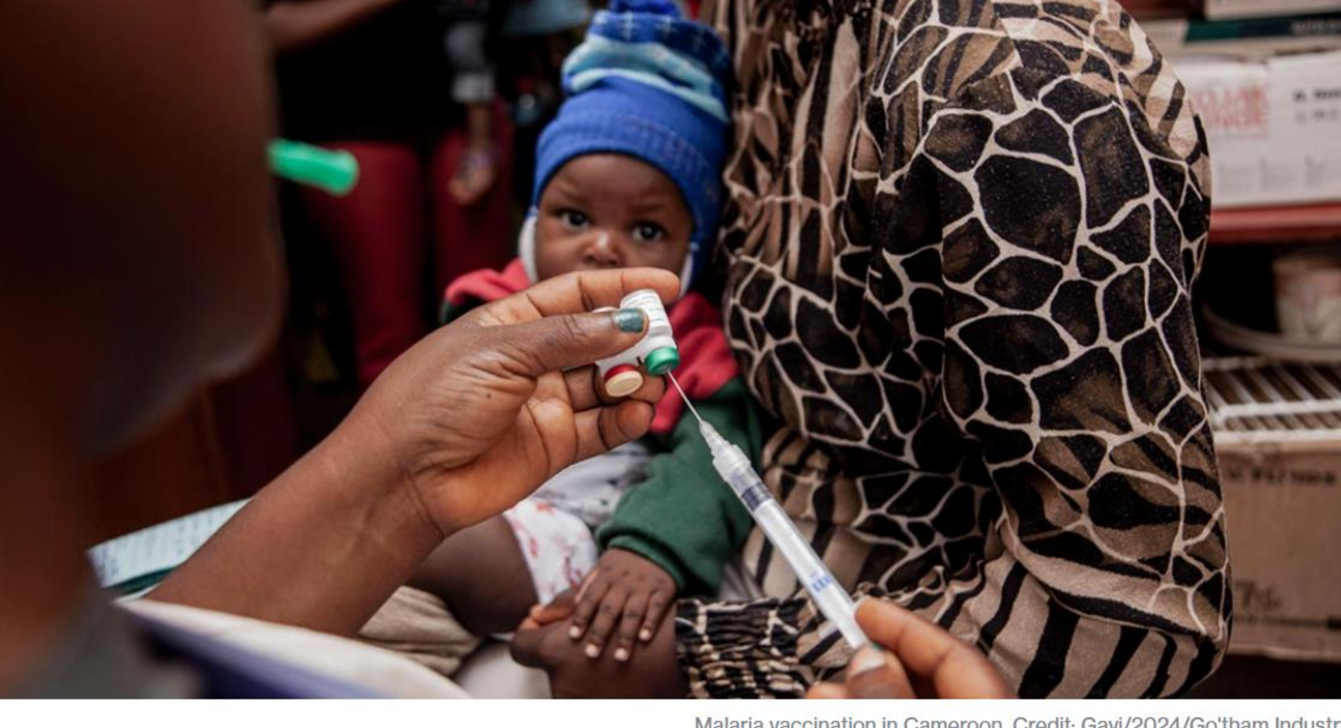
Malaria vaccination in Cameroon.