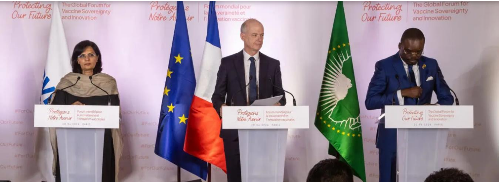
Gavi Pre-Replenishment Conference and Investment Opportunity, Paris June 20, 2024