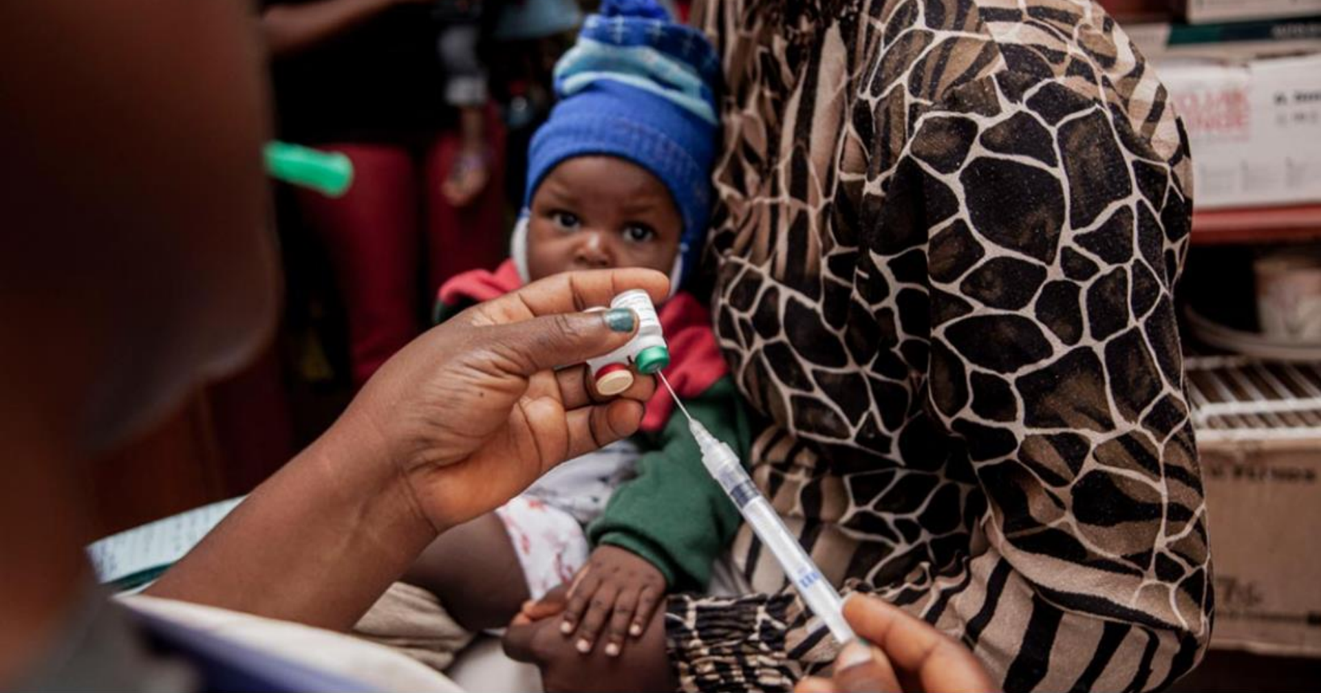
Malaria vaccination in Cameroon.