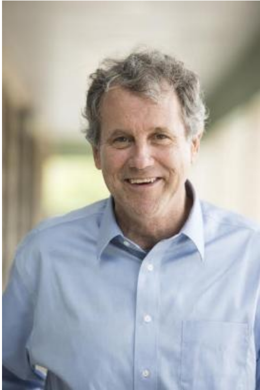
Former Senator Sherrod Brown (D-OH)