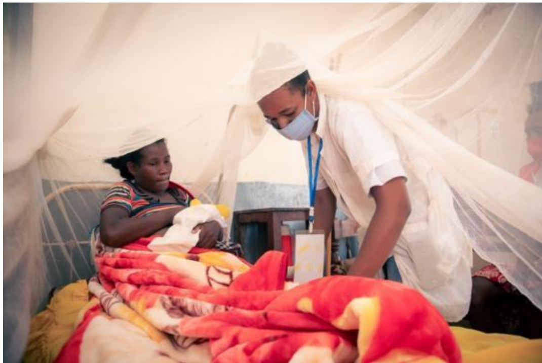
February 2021

We must speak up for critical health and anti-poverty programs and call on Congress to do the same