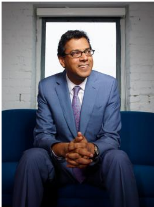
Dr. Atul Gawande Assistant Administrator for Global Health at USAID