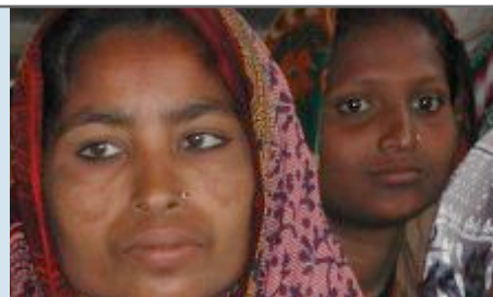
Microcredit borrowers, Bangladesh; photo: Barbara Wallace

In 2004, RESULTS staff and volunteers championed these solutions with elected officials and the media. Their efforts included face-to-face meetings with 34 representatives and 8 senators. Volunteers also had hundreds of meetings with congressional staff in their districts and in Washington, D.C. They also generated 41 newspaper editorials, 18 feature articles, 42 op-ed pieces, 102 letters to the editor and 24 radio pieces on our issues, and sent hundreds of letters to members of Congress every month.