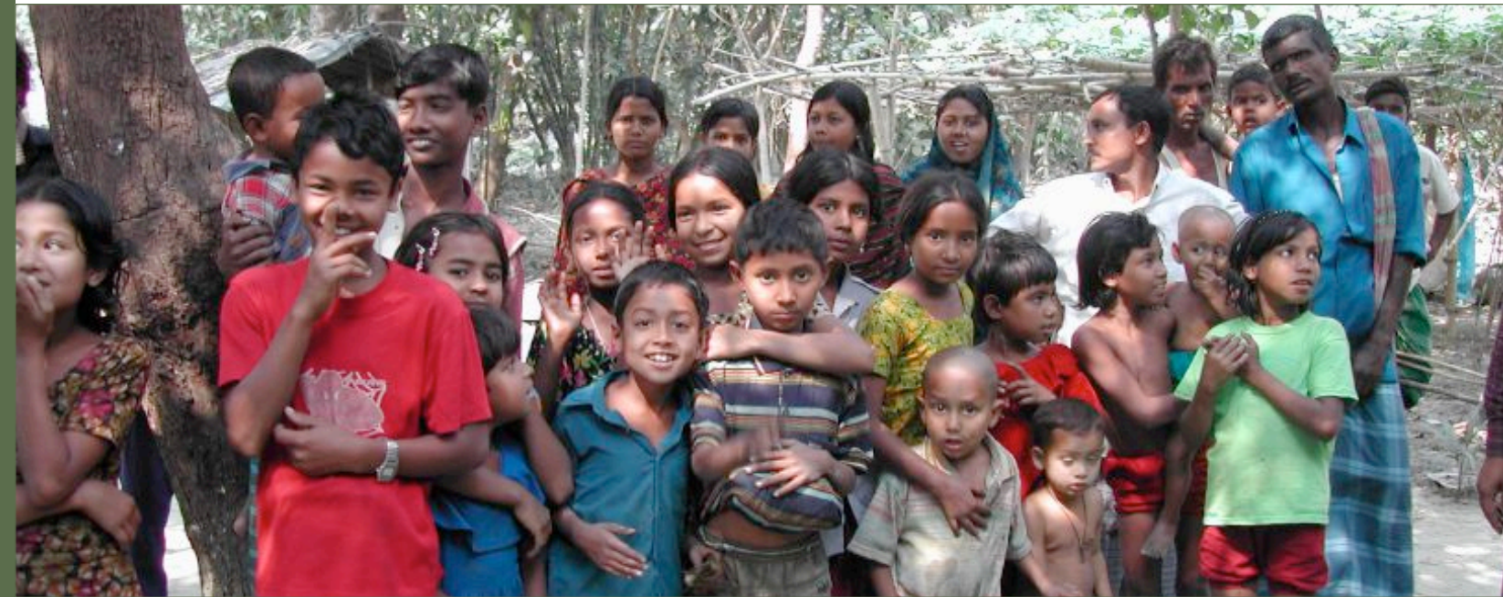
Grameen Village children, Bangladesh; photo: Barbara Wallace

RESULTS Educational Fund is a non-profit 501(c)(3) organization whose purpose is to create the public will to end hunger and the worst aspects of poverty. We accomplish this aim through citizen education and training, hosting public events and community forums, media coverage, teaching trips, and research.