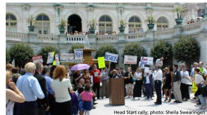
Head Start rally

In 2004, the ASPIRE Act was introduced in Congress. It provides every U.S. child, at birth, a savings (KIDS) account that can be used after the child reaches the age of 18 for education, home ownership or retirement. RESULTS volunteers educated their members of Congress and the media to build momentum toward passage. The legislation did not pass, but was to be reintroduced in 2005.