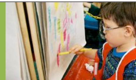
Head Start student; photo courtesy the Community Action Project of Tulsa County, OK

In 2004, RESULTS domestic activists built public and political support for these issues in a number of ways. They met face-to-face with 25 representatives and eight senators. Domestic groups organized 64 outreach meetings that enrolled 43 new activists. They sent thousands of letters and generated hundreds of calls to members of Congress. Activists and staff also generated six feature articles and 31 letters to the editor.