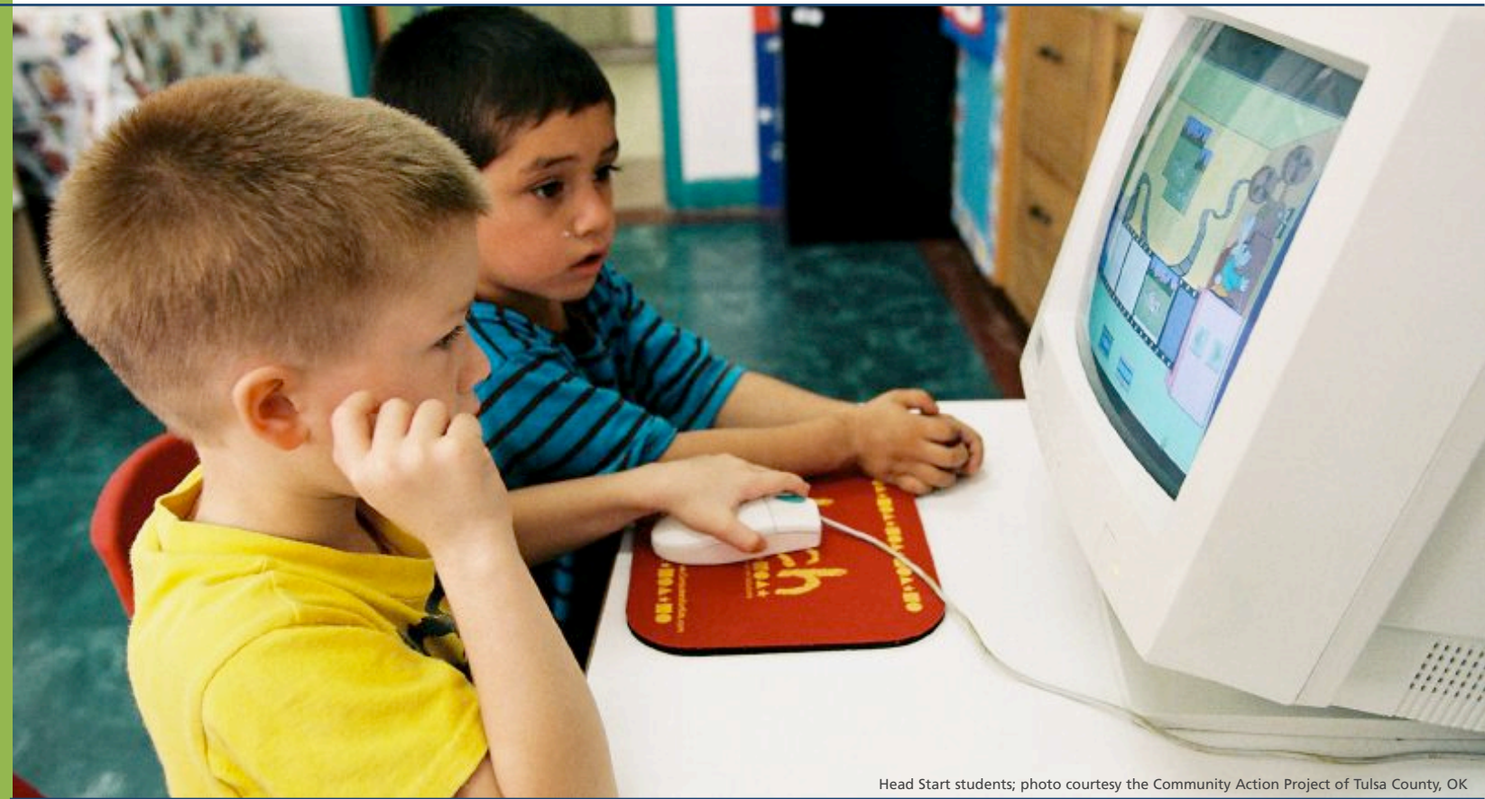
Head Start students

After this trip, Senator Durbin had the opportunity to question the administrator of the U.S. Agency for International Development (USAID) in a Foreign Operations Subcommittee hearing. Senator Durbin engaged in a long exchange with the administrator and raised the issue of USAID prioritizing microenterprise, and especially ensuring that money reaches the most effective programs in the field.