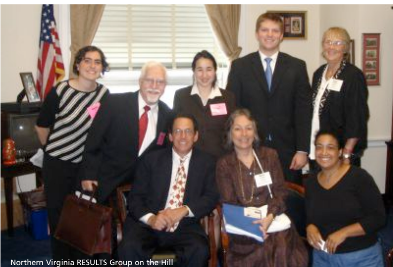
Northern Virginia RESULTS Group on the Hill