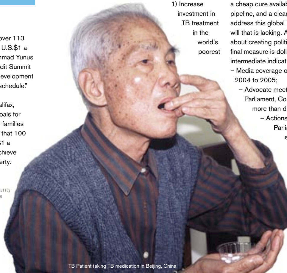
TB Patient taking TB medication in Beijing, China

Invigorating political will through education, revolutionizing oversight through research, and facilitating effective partnerships through communication and strategic planning, the ACTION project promises great results toward the eventual elimination of TB.