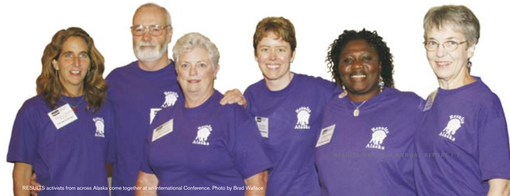
RESULTS activists from across Alaska come together at an International Conference.

famous authors and activists, spoke words of encouragement and motivation to the grassroots in attendance. National and international staff, Board Members and volunteer regional coordinators also worked with the attendees to sharpen their lobbying and advocacy skills, and to train and empower activists in taking targeted actions. The combination of three days of educational panels, inspirational speakers and instructive skill-building workshops helped prepare RESULTS activists for over 300 meetings with Congressional offices as well as many meetings with key high-level staff from the World Bank and IMF, where members of Congress and world leaders were effectively educated on the issues. The 2005 International Conference was a time to celebrate RESULTS' strong history of success in building the political will to end hunger and poverty as well as a time to look ahead and prepare for future progress.