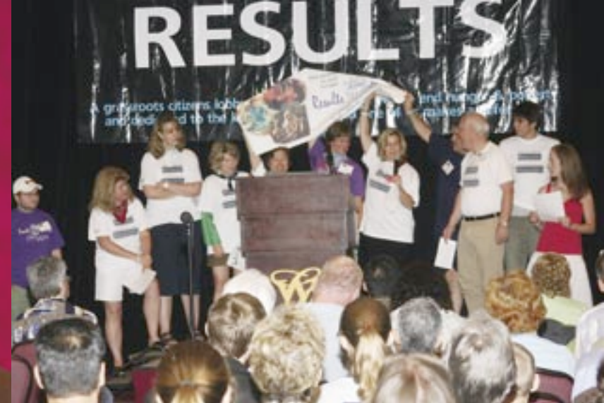
RESULTS Canada takes the stage during an International Conference.

RESULTS was sparked by a dawning awareness of the gap between caring about inequalities caused by hunger and poverty and taking action to change them. This gap resulted from a lack of knowledge about the political process and a sense of hopelessness to impact it.