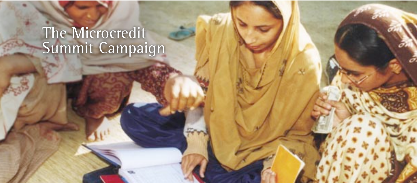
Microcredit loan borrowers in Pakistan sign their loan repayment records.

“To me, [the Microcredit] Summit is a grand celebration... of the freeing of credit from the bondage of collateral. This Summit is to pronounce good-bye to the era of financial apartheid. This Summit declares that credit is more than business. Just like food, credit is a human right... This Summit is about creating a process which will send poverty to the museum.”