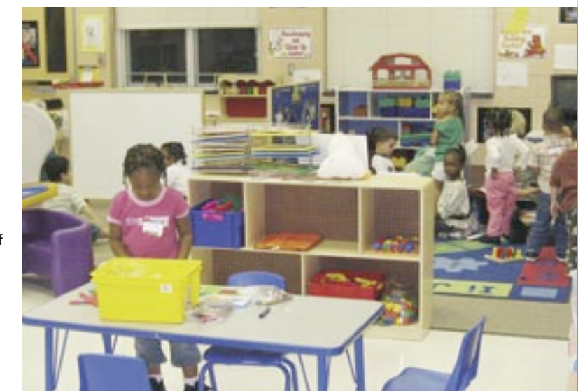
C. Paul Barnhart Elementary School Head Start classroom in Waldorf, MD.

These successes have established RESULTS and RESULTS Educational Fund as leading poverty eradication advocacy organizations. As the movement to make poverty history gains new found momentum, we will continue to work as we have for the last 25 years to shape an equitable world where everyone’s needs are met.